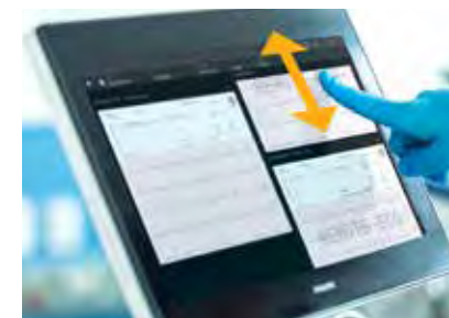
Scroll through previous ECGs to compare with your current report.