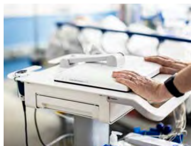
The Cardiac Workstation screen folds for easy transport.

Touchscreen display can be tilted to reduce glare or pulled forward to provide easy access to the built-in keyboard.