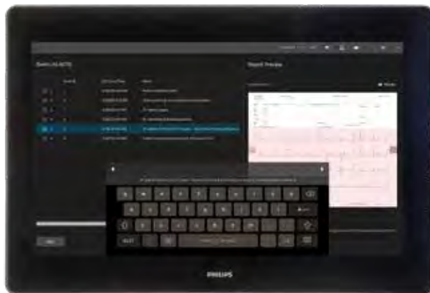
Edit annotated disclosure events list while assessing individual reports.