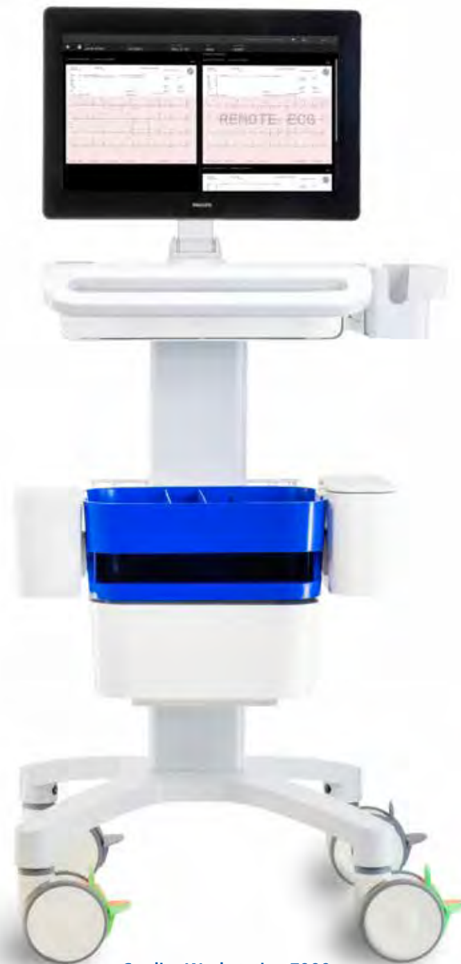
Cardiac Workstation 7000 18.5 in display

Philips Cardiac Workstations all share the same DNA. No matter how demanding or diverse your cardiac care challenges, our family of clinically advanced workstations delivers accurate, high-quality ECGs – simply, quickly, consistently.