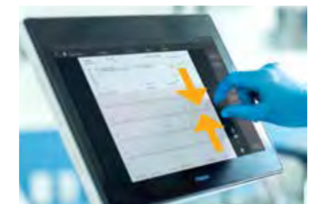
Zoom back out to see the big picture and take the next step.