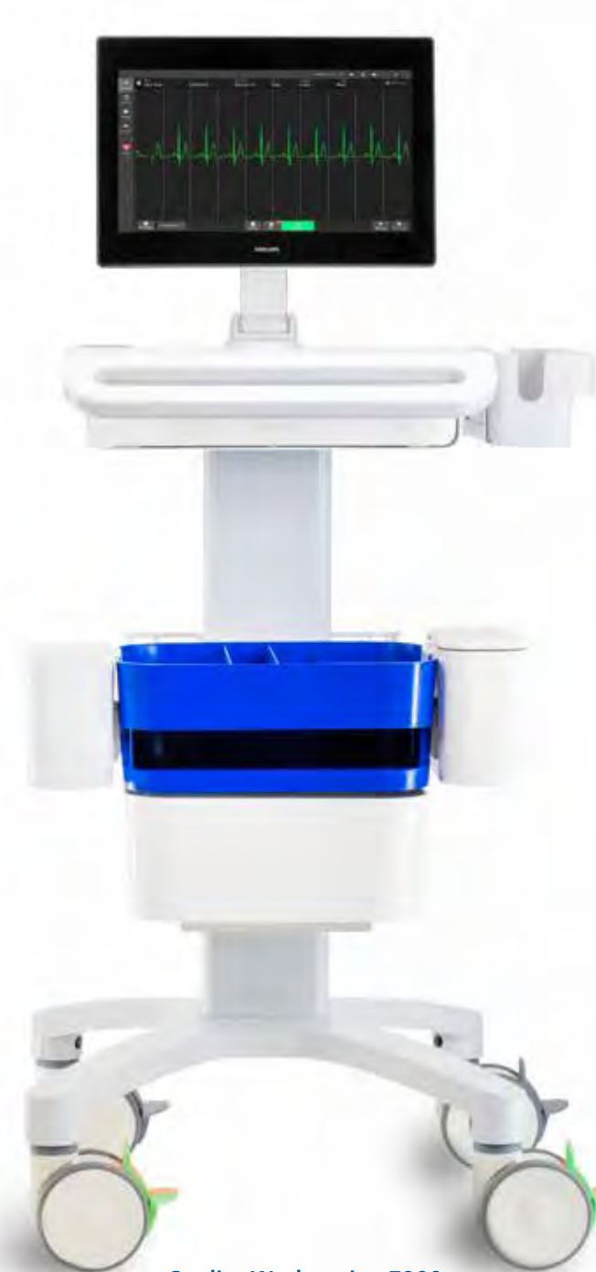
Cardiac Workstation 7000 15.6 in display