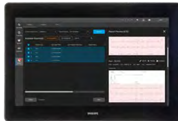
View archive list as you scroll through multiple report previews.