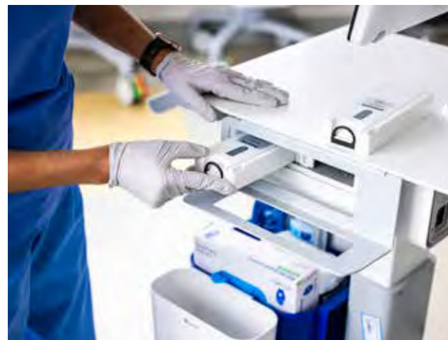
Cardiac Workstation 7000 has enough battery power to support your shift.