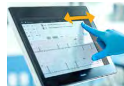
Zoom in to view details. Swipe left or right for more info.