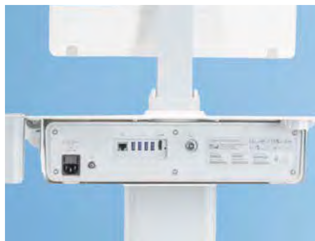
Four USB 3.0 ports and an HDMI interface support add-on devices – keyboards, large external displays, and future technology advances.