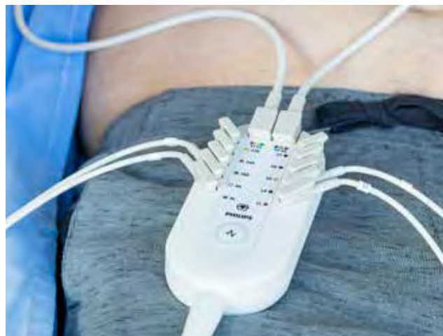
Lead wires are designed to minimize tangling and sticking.

One glance and it's clear that the Cardiac Workstation stands alone. This ergonomic work of art makes all the right moves. It rolls, tilts, swivels, elevates, drops, folds, and turns – to bring critical ECG information closer to you, while you stay close to your patients. Both the Cardiac Workstation 7000 and 5000 are integrated into nimble, compact, fixed or height-adjustable trolleys, so you're ready to rock when you roll.