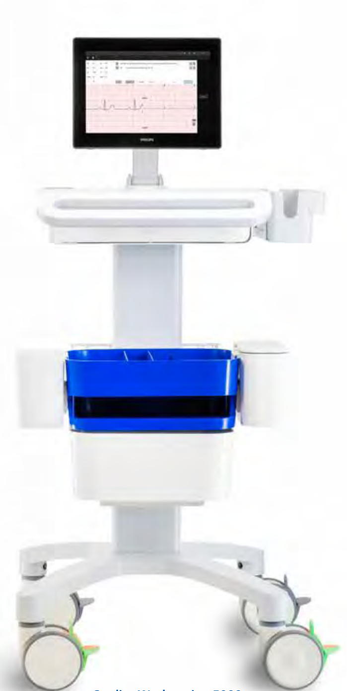
Cardiac Workstation 5000 12.1 in display