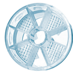
Sequenced trap chambers and direct bypass chambers